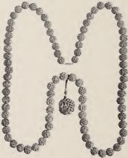
NECKLACE IN CARVED CORAL